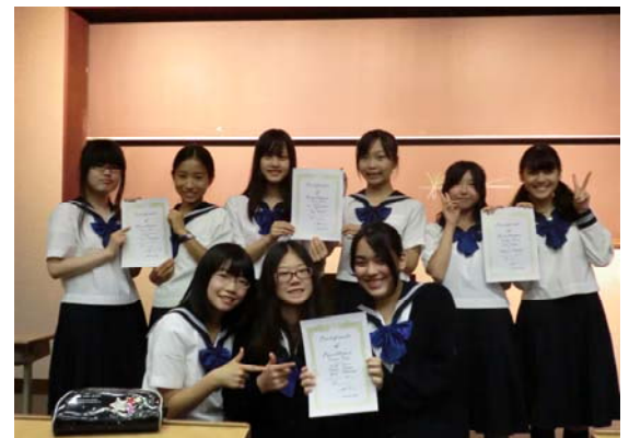
9 th Grade Presentation Contest Winners

The 8 th grade students had the task of preparing a recitation of a text. This year's text was entitled "Don't Touch It!". It is an interesting tale of three boys in China which many of the students found very entertaining. Once again, the level was very high and all of the girls did very well. The teachers were very impressed by the confidence and fluency shown by many of the entrants.