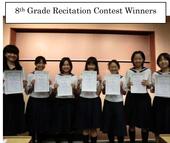
8 th Grade Recitation Contest Winners