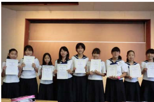
7 th Grade Speech Contest Winners