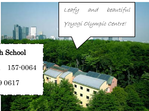
Leafy and beautiful Yoyogi Olympic Centre!