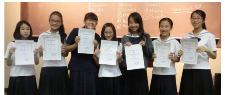
The 7 th Grade Winners

今年度も期末試験約1週間前に、本校中学生による英語スピーチコンテストが開催されました。昨年と同様、今年も学年によって発表するテーマが異なり、中1は自己紹介、中2は物語の暗唱、中3は日本の文化についてのプレゼンテーションを行いました。 ※受賞者の名前は、上の英文に記載しています。