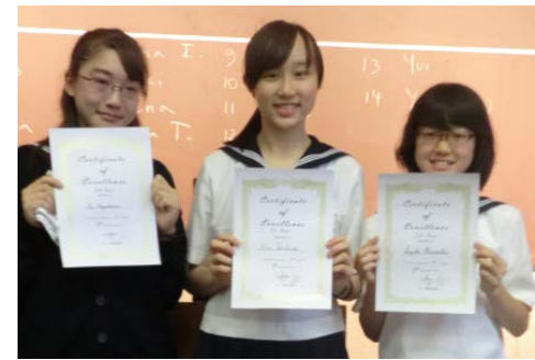
The 8 th Grade Winners